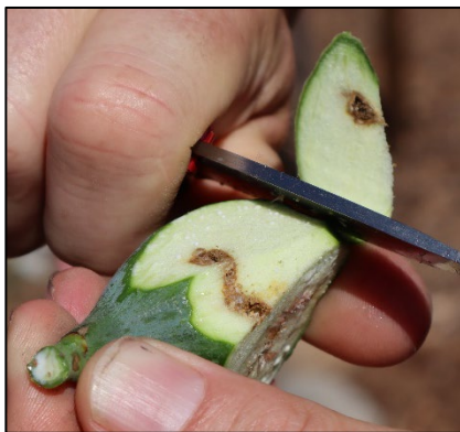
Figure 2. Internal damage to the fig from larval feeding.