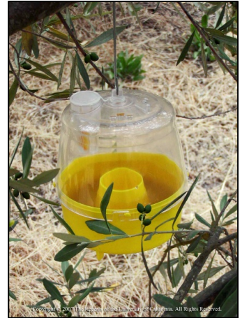
Figure 5. McPhail trap.

Management: Biological control appears to be limited and there are currently no chemical controls registered specifically for this pest on California figs. As such, orchard sanitation is critical, and growers should make sure to remove and destroy any BFF-infested fruits. Larvae in infested fruit are protected from pesticide sprays and there are no effective soil drenches for pupal control. Insecticidal baits (e.g. GF-120 NF Naturallyte®) may be useful for control of adult BFF but note that label rates have not been directly tested for efficacy against this pest. Consult with a licensed pest control adviser and your County Agricultural Commissioner before applying any chemical controls.