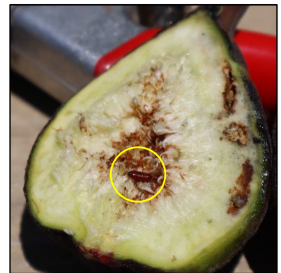
Figure 4. BFF pupa found inside of a fig.