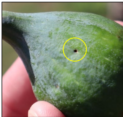
Figure 3. Exit hole from larva burrowing out of the fruit.